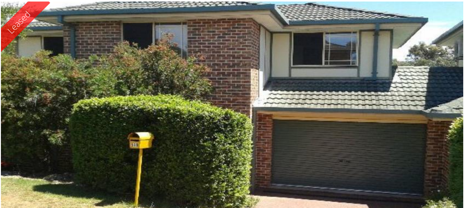
14B Griffin Pl, Doonside