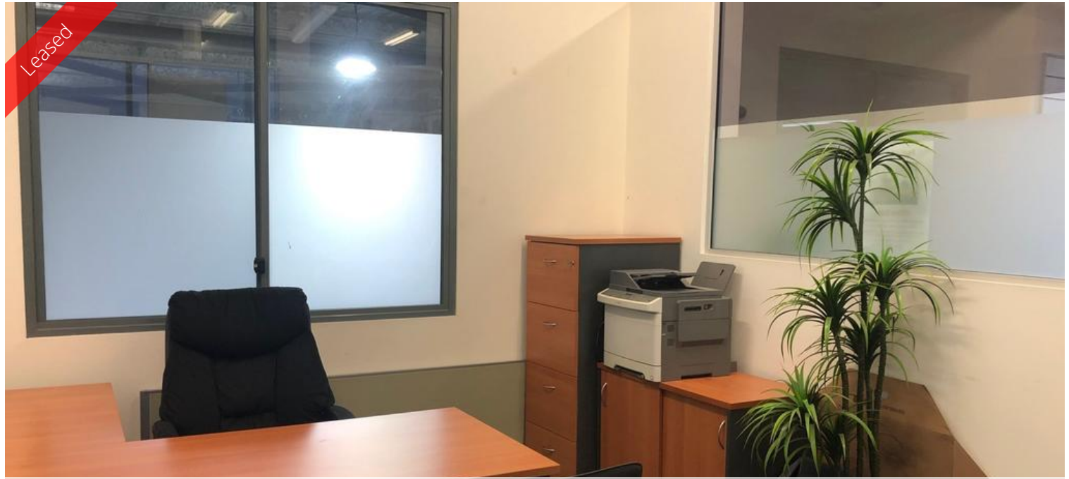
Unit 44, 49-51 Mitchell Rd, Brookvale