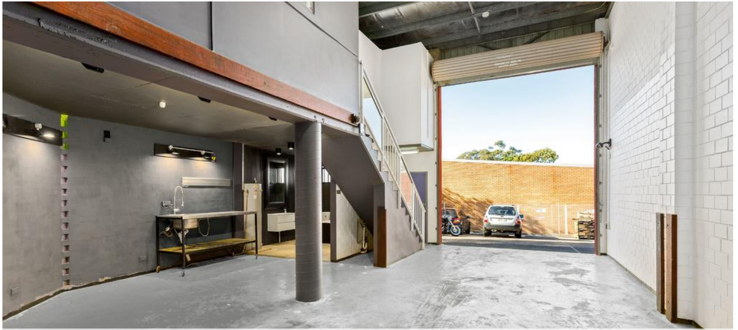
Unit 8, 7 Clearview Pl, Brookvale