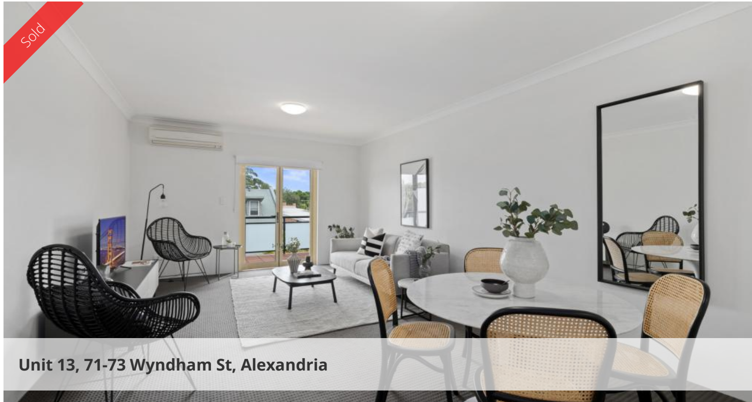
Unit 13, 71-73 Wyndham St, Alexandria